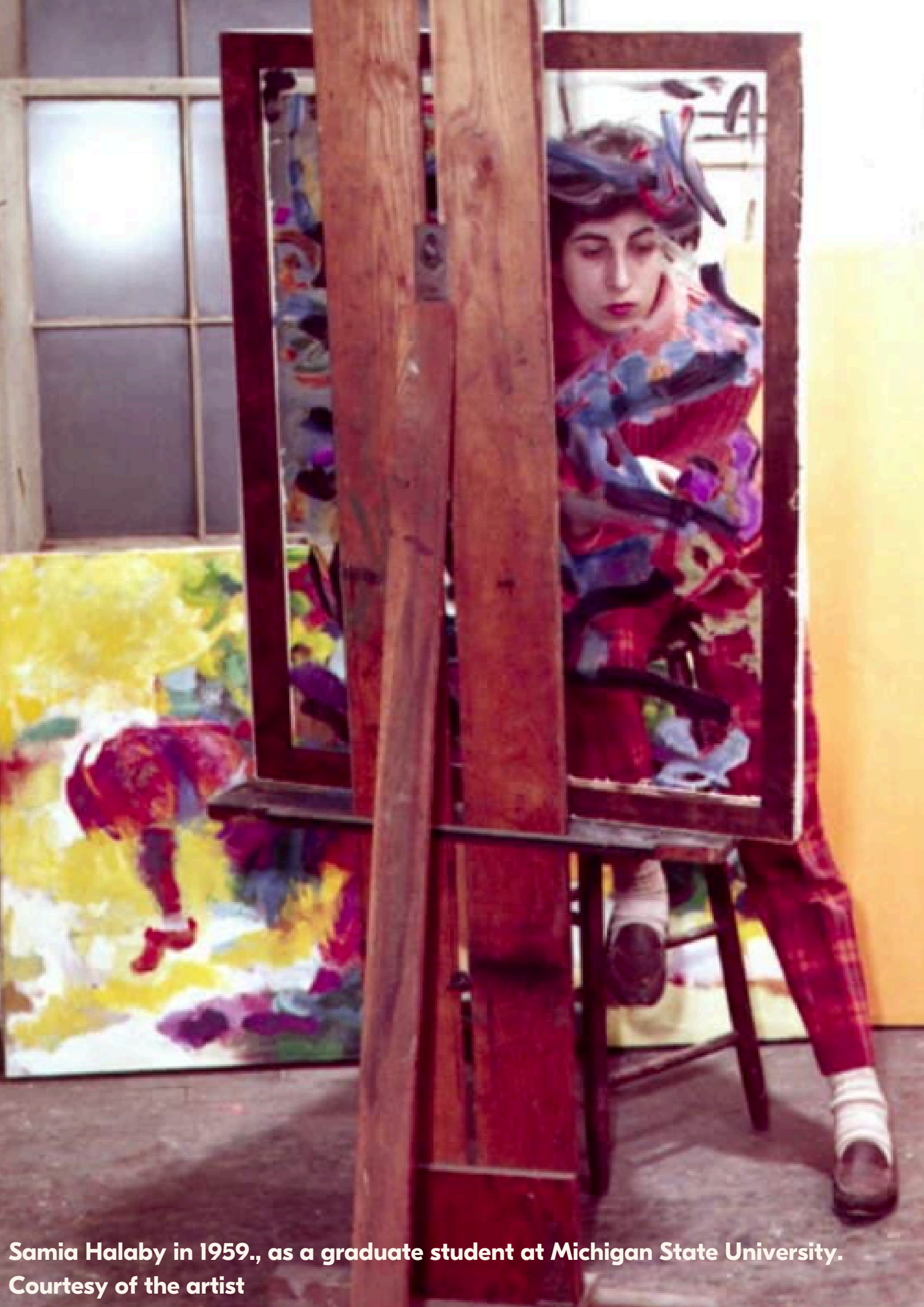
Samia Halaby in 1959., as a graduate student at Michigan State University.